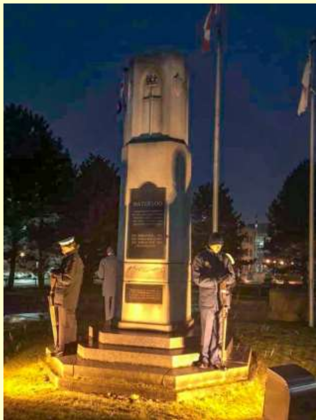
Waterloo Cenotaph Vigil – Cadets from Royal Canadian Sea Cadet Corps 94 Warspite and 530 Havoc Royal Canadian Air Cadet Squadron participate in the overnight vigil at the Cenotaph in Waterloo, ON.

Cadets enjoy these opportunities to learn new skills and while some may strive for excellence, others simply enjoy the activities. By competing in regional competitions, Cadets can earn opportunities to move on to compete at both the Provincial and National levels.