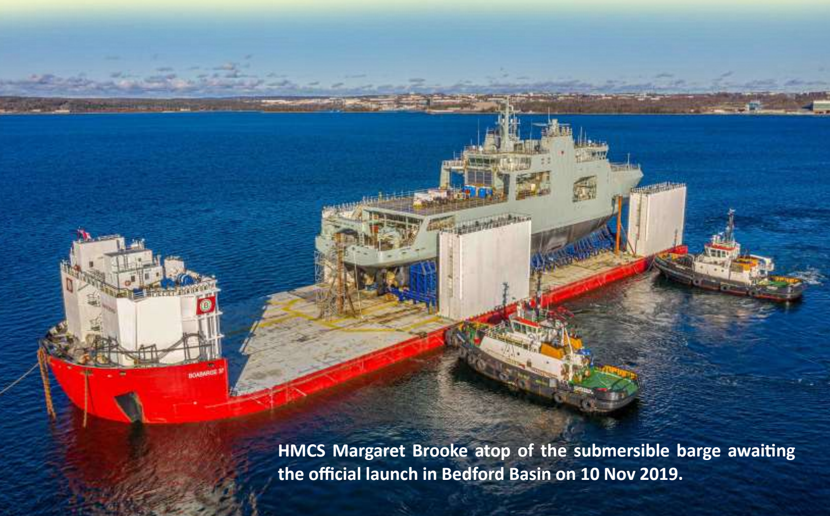
HMCS Margaret Brooke atop of the submersible barge awaiting the official launch in Bedford Basin on 10 Nov 2019.