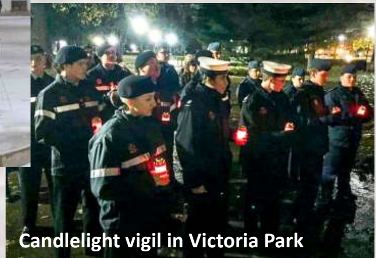
Candlelight vigil in Victoria Park