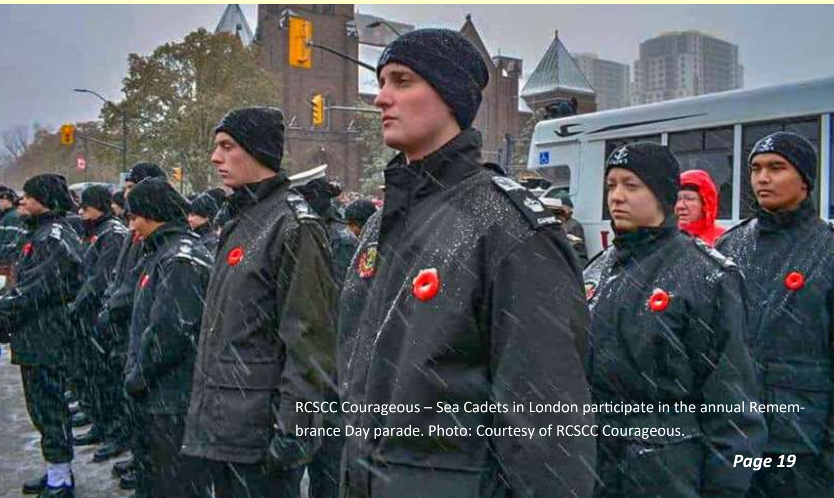
RCSCC Courageous – Sea Cadets in London participate in the annual Remembrance Day parade.