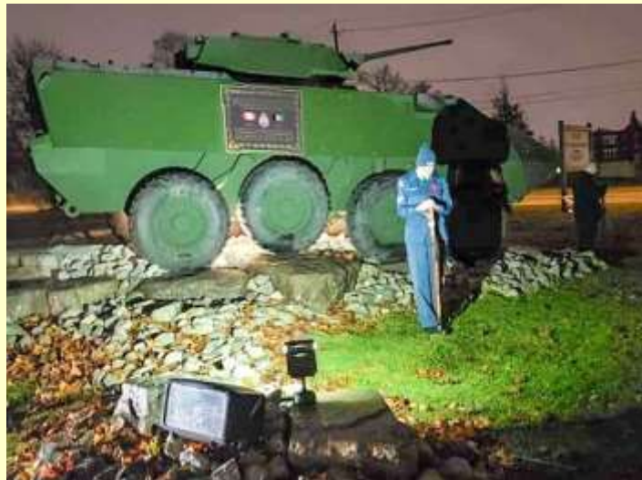
Kitchener Armoury Vigil – As a secondary location, junior Cadets from 80 K-W Spitfire Royal Canadian Air Cadet Squadron in Kitchener gain experience by standing watch over the Afghanistan LAV Monument at the RHFC Armoury in Kitchener.

As the Cadets settle into their 2019-2020 training year, outdoor fall training is winding down and team training is now in full swing for many of the various disciplines including biathlon, marksmanship, effective speaking, band and drill.