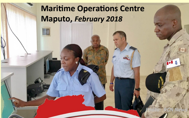
Maritime Operations Centre Maputo, February 2018