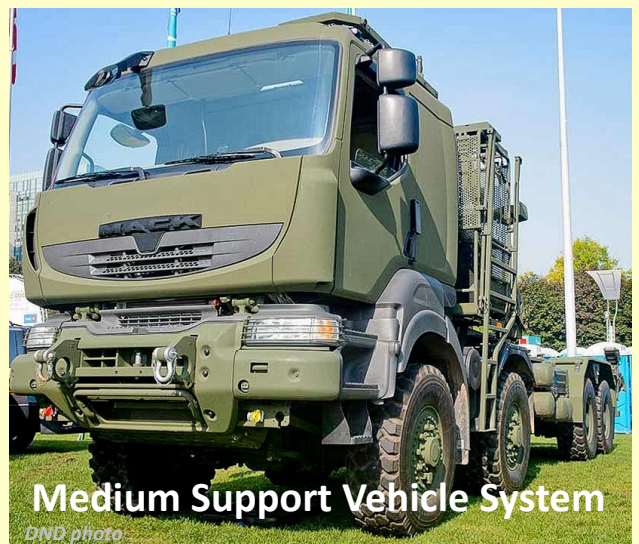
Medium Support Vehicle System

The Company also has members who are engaged